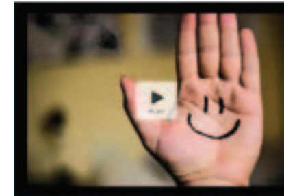
A FORMER DRUG ADDICT PRODUCED A DIGITAL STORY ON HIS EXPERIENCE WITH DRUGS, ADVOCATING AGAINST LABELLING PEOPLE. VIDEO: LAKI