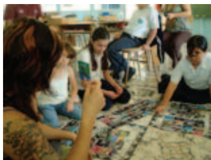
THE BOARD GAMES WITH PHOTOS GATHERED BY PÉREZ ZELEDÓN SCHOOL CHILDREN WERE TRIED OUT BY BOYS AND GIRLS FROM OTHER SCHOOLS.