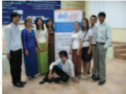
THE OPEN INSTITUTE WOMEN'S TEAM DURING THE WOMEN'S FORUMS.

Reports indicate that one out of three women worldwide suffers from some form of gender-based violence. As part of the global campaign "Say NO to Violence Against Women", the Open Institute conducted three forums on "Reclaiming ICT to end violence against women" in late 2008. Through these forums, they uncovered key challenges in the use of ICTs to end violence against women, and put forth a series of pertinent recommendations to be implemented in Cambodia as part of the country's Millennium Development Goals (MDGs).