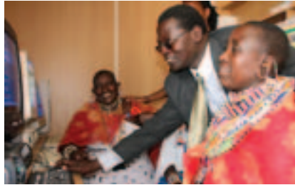
INSIDE THE MAARIFA (KNOWLEDGE) CENTRE, WOMEN RECEIVE TRAINING.