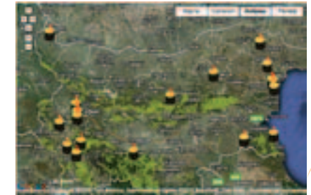
"SAVE THE FOREST" ALERTS MAP.

In 2009, BlueLink developed a project named "Expose and Improve: The power of IT in combating illegal logging" in order to address the intensive illegal logging that is accelerating the extinction of forests in Bulgaria. The project combines digital tools and green activism in an online system for filing whistleblower alerts on illegal logging. The online platform mobilised citizens to raise the alarm and ensured follow-up by BlueLink's active partnership with expert NGOs and the State Forestry Agency (SFA).