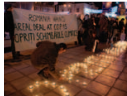
ACTIVISTS ADVOCATE FOR "THE REAL DEAL" IN CLIMATE CHANGE POLICY DURING THE 2009 UN COPENHAGEN CONFERENCE USING A SITE DEVELOPED BY STRAWBERRYNET.

StrawberryNet wrote the Romanian report 20 for APC's Global Information Society Watch 2009, which focused on advancing democracy through access to online information. There they analysed how the country responded to its incorporation to the European Union and gave an overview of ICT policy. They pointed out that access to online information followed a top-down dissemination model, and that few grassroots ICT initiatives have attracted public attention and support. The report recommended that bottom-up initiatives be encouraged through funding, and skills transfer and networking supported in order to enable citizen participation in shaping and developing local content.