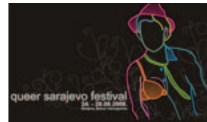
THROUGH DIGITAL STORIES PRODUCED WITH QUEER SARAJEVO FESTIVAL VOLUNTEERS AND PARTICIPANTS, OWPSEE FOUGHT VIOLENCE AND STIGMA.