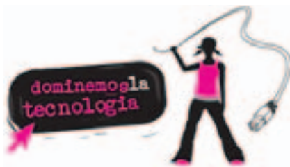
NODO TAU COMBINED WEB 2.0 AND POPULAR EDUCATION IN THE BUENOS AIRES WORKSHOP.

“We are fighting because the laws that regulate prostitution in Argentina, which generate exploitation, abuse and violence against sex workers, are unconstitutional,” declared an Argentine human rights organisation on the launching of its new blog. This was one of five blogs created during a social networking workshop offered by Nodo Tau as part of the first Argentine Feminist Tech Exchange (FTX) organised in Buenos Aires in November as part of APC’s MDG3 Take Back the Tech! to end violence against women initiative.