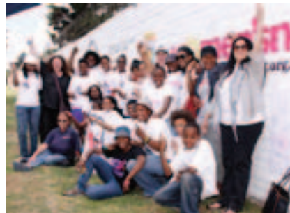
WOMEN'SNET TOOK TO THE STREETS OF SOWETO DURING THE SIXTEEN DAYS OF ACTIVISM TO PREVENT VIOLENCE AGAINST WOMEN. "WE TALKED TO COMMUNITY MEMBERS AND TAXI DRIVERS AND PAINTED A MURAL WITH THE TAKE BACK THE TECH! LOGO," SAID WOMEN'SNET.

Women'sNet focused on upscaling their efforts to provide a platform for marginalised women and girls in South Africa in the year of national elections. They launched a video campaign where women and girls recorded voice messages which were later taken to political parties for discussion. In the same year, they also worked with sex workers to create digital stories. The workshops took place in Cape Town and Johannesburg. These stories were developed in partnership with the Sex Worker Education and Advocacy Taskforce (SWEAT) and they will be used as advocacy tools.