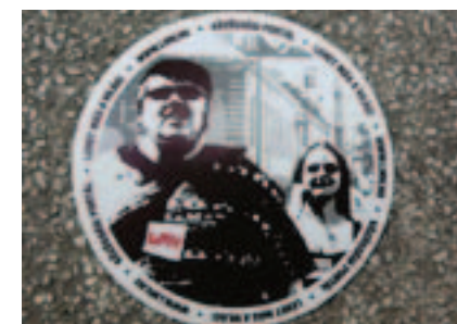
STICKER PROMOTING GREEN SPIDER'S LMV, A SOCIAL NETWORKING TOOL FOR HUNGARIAN ACTIVISTS.

Following a pattern amongst East European APC members, from 2008 to 2010 Green Spider gradually restructured its activities to focus on more policy and content-based cooperation with their users rather than providing hosting and access services. The motivation was to seek more active engagement and to react appropriately to the changing landscape of ICTs, now that internet connectivity is widely available.