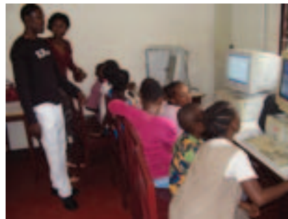
STUDENTS AT THE LYCÉE IN YAOUNDÉ LEARN COMPUTER SKILLS.