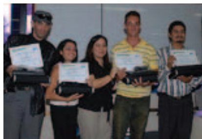
TRAINING FOR DEAF PEOPLE WAS DONE WITH THE HELP OF INTERPRETERS. THE NEXT STEP IS TO HAVE DEAF INSTRUCTORS.

EsLaRed organised a Cisco Academy course on IT basics for a group of students including six deaf participants. The contents were presented in Spanish and Venezuelan Sign Language using interpreters so that the deaf students were able to participate regardless of the magnitude of their hearing loss or whether or not they use cochlear implants or other high-cost devices commonly out of the reach of the poorest members of the community.