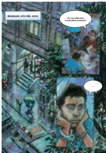
THE DANGEROUS CONSEQUENCES OF A "SAFETY FIRST" POLICY ON THE NET ARE ILLUSTRATED BY A CARTOON PRODUCED BY PANGEA AND OTHER EUROPEAN HUMAN RIGHTS ORGANISATIONS.

Daniel is a photographer who lives in Europe. He works for a magazine and has recently travelled to Pakistan and the United States to illustrate an article about the architecture of mosques. When he gets home he is arrested as his internet profile (emails, chats, blogs, social networks) matches that of a cyber terrorist. Luckily he is eventually released.