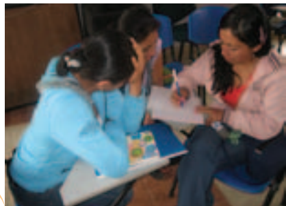
KIDS BETWEEN THE AGES OF TWELVE AND EIGHTEEN PARTICIPATING IN GENDER WORKSHOPS IN THE BOYACÁ TELECENTRE, IN EAST COLOMBIA.

In 2009 Colnodo's Strengthening Telecentres initiative went from strength to strength. More than 5,200 people were trained in how to use ICTs. Five regional telecentre encounters were held for over 400 participants. Three virtual training semesters were run at the National Telecentre Academy and the year ended with fifteen online courses written and over 540 people certified.