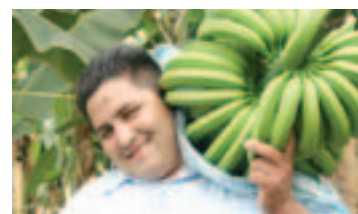
FAIR TRADE GUARANTEES A FAIR DEAL FOR ALL.