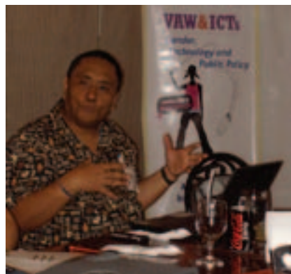
AL ALEGRE OF FMA PRESENTS INITIAL ISSUES ON THE INTERSECTION OF VIOLENCE AGAINST WOMEN AND ICTS IN A FOCUS GROUP.