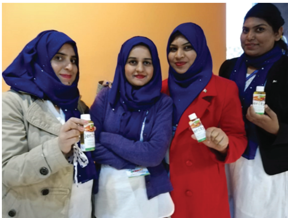
Jeroty started off as an idea developed for a university competition and the brand's products are now being sold to salons in Islamabad and Rawalpindi.

help them reprocess the dried fruit and then market the products. What was meant to be something that could help us win a university competition, is now a brand with products that we are selling at different salons in Islamabad and Rawalpindi”.